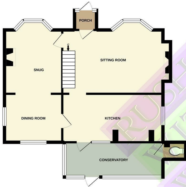
GROUND FLOOR 711 sq. ft. (66.0 sq. m.) approx.